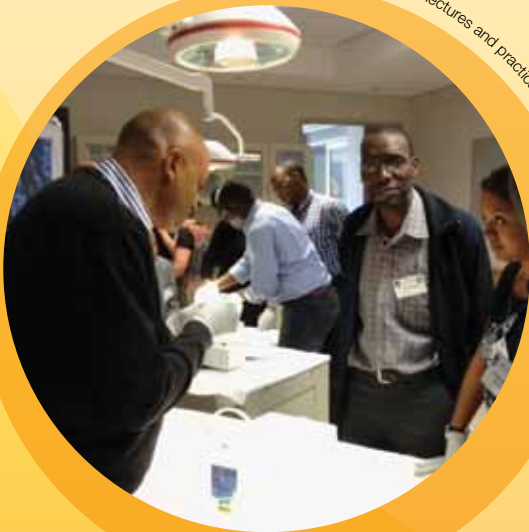
A mix of lectures and practical training make for a successful workshop.