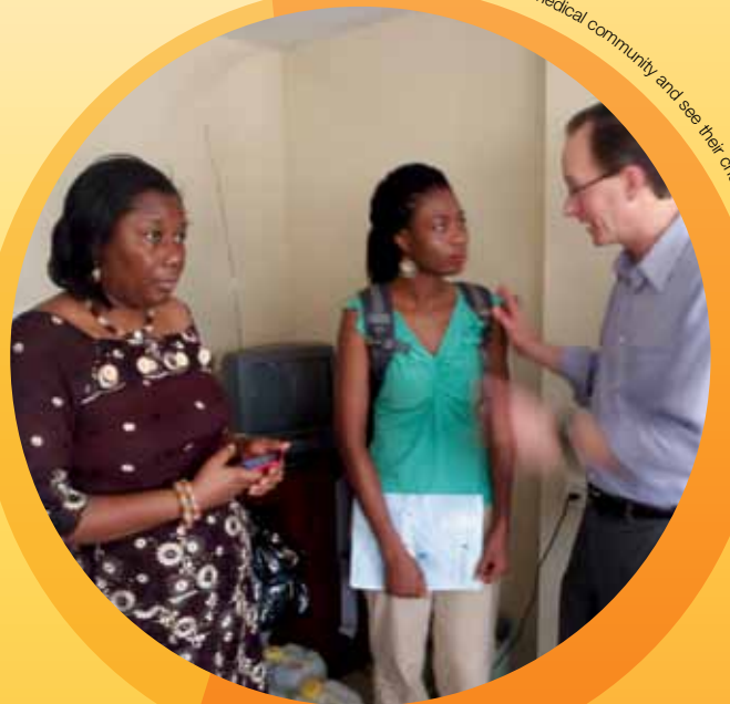
A chance to meet the local medical community and see their challenges first-hand.